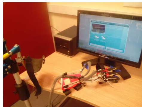
Figure 1 The SCRIPT system. Videos demonstrating the system can be found on the Youtube channel

Our approach for developing such component was that of defining a gesture recognition system which enabled subjects to control the games by moving their arm, wrist and fingers. This modular approach makes such interaction potentially expandable to other games and allows a more comprehensive training. Design and development was evaluated using formative assessment of the work with a triad of patients, their family members and their health care professionals. The system had then undergone summative evaluation with 20 patients. In this paper, we investigate how subjects focused on arm, wrist or hand training, based on their level of impairment.