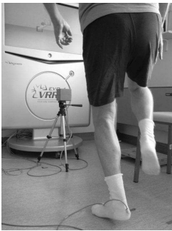
Fig. 2: Patient 1 is seen leaning on the plegic side, the sensor is placed at the plegic calcaneus level and ask him to rise the heel, increasing ankle plantar flexion, significant movement on toe-off in the pre-swing phase. The patient gets continuous feedback, more accentuated on the arrival so that the range of movement is completed.

completed was an analytical exercise in leg stance on the plegic side. The participant was asked to lift his heel (triceps surae concentric work) to improve the generation of power needed in the final support stage and to achieve an adequate step length. A sensor was placed at the level of the participant's heel and an initial trajectory was recorded allowing him to lower part of his weight while leaning on a stick he was holding in the opposite hand. Thus, the center of gravity was centered and the weight that fell on the plegic LE was lower, allowing maximum elevation of the heel (greater amplitude in the range of dorsal flexion). This was repeated and as the exercise progressed less weight was placed on the stick and more weight fell on the plegic leg. Finally, the participant managed to achieve this task without using the stick [Fig. 2].