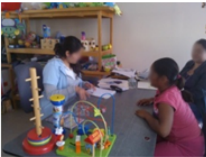
Figure 1: Non-participative direct observation of a traditional occupational therapy session.