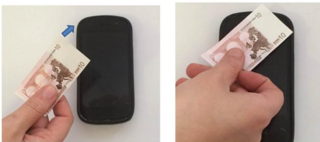
Figure 2. Style of Interaction. The user brings the digitized object (Tangible User Interface) close to the mobile device (interaction resource) that incorporates the NFC Reader.

-MainUI (Main User Interface). It is the main interface of the system. It graphically displays the information, including animations, texts, sounds and user's score. At all times, it shows the progress and course of the game, the feedback and ludic cues.