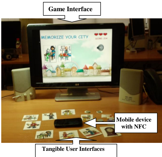
Figure 1. Therapy session using the proposal game

The interface is the means by which the user interacts with the system, therefore it is very important that they are easy to understand, simple and intuitive . The next prototype is implemented in a distributed user interface setting composed of three types of interfaces (See Figure 1):