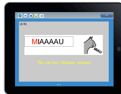
Figure 5. Diagnosis screen

The teacher or parent receives the suggested exercise/s the child has to perform in his/her terminal so to support and finalize the diagnosis. These exercises can be repeated several times in many different histories targeting at detecting the phonemes the child has difficulties in pronouncing them properly. In Figure 5, the child pronounces the phonemes; the application stores the data and finally the data is sent to the server.