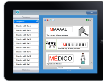
Figure 4. Generated histories collection

personalized library, the therapist may perform the necessary modifications for every diagnosis and/or treatment. Therefore, the interface provides options for 'search' and 'edit' at the top screen section, where the user can pre-visualize, add, remove or share a patient's history.