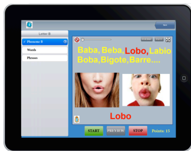
Figure 7. Phonetic exercises tables

The parent or teacher can click on the “mirror” button, so to aid the child to compare the image of his/her lips, captured by the tablet’s webcam, with the ones on the video. Below, screen captures present the ways the rehabilitation exercises of the phoneme /b/ are represented on tables. These tables are consisted of several written words with the consonantal sound /b/. In Figure 7, the child pronounces the words and watches both the video and his face so to improve the lips positioning during the pronunciation of the phoneme /b/.