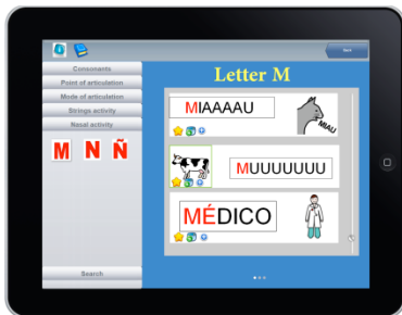
Figure 1. Phonemes histories generation screen

First, a prototype environment was designed; the system uses pictograms with added text to facilitate the speech therapist at creating words' composition so that a child can watch his/her process with his/her parents or tutor targeting at providing an initial diagnosis.