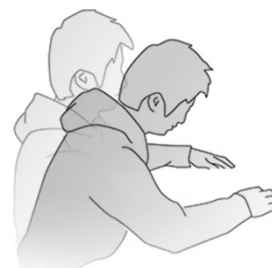
Figure 1. Example of compensation movement.

Paralleling the advances in wearable application in rehabilitation, also provides great superiority for the development of upper-extremity rehabilitation, a number of SRG's aiming at support arm-hand training have been developed [7], [8]. Although wearable technology shows great promise and provides many