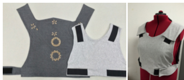
Figure 3. Prototype of smart rehabilitation garment.

The garment, as shown in Figure 3, is designed in “front” and “back” parts for ensuring the accurate sensor position and measurement. Based on the adjustable design on shoulder and wrists, the garment can fit multiple sizes of people and keeps the sensors close to users' body and at the right location.