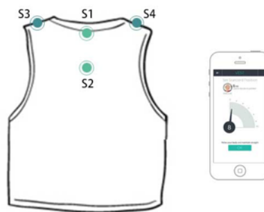
Figure 2. System overview.