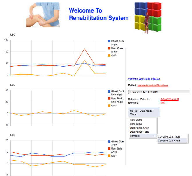
Figure 3: Rehab-aaS: a graphical analysis of a recorded rehabilitation session on the Cloud side.

To estimate the flexion and rotation information of the limbs, the proposed system uses SPINE-enabled wearable nodes [6] equipped with 3-axis accelerometer sensors. The application configures the nodes to sample the accelerometer at a sampling rate of 30Hz so to monitor limb bending movements dynamically (green, as in the application screen-shot shown in Figure 2; it also allow to overlap the visual real-time feedback with the reference movement model, recorded by the physiotherapist during a set-up phase (orange, as in the application screen-shot shown in Figure 2). The application scenario consists of two steps, namely setup and exercise phases. During the set-up phase, the user wears two sensors on either leg or arm that needs to be exercised and performs the correct exercise under the guidance of rehabilitation professional. Meanwhile, the system records the data and stores it as reference exercise. Then, during the exercise phase, the user repeats the bending movement and is provided with a real-time feedback about how the movement is done with respect to the stored reference exercise. All the rehabilitation session data are also securely transmitted to a Cloud server using the BodyCloud infrastructure. A number of improvement indexes are reported in a separate panel, so to allow the patient to get quantitative information regarding his improvements throughout the rehab therapy. In addition, the application retrieves online the patient's rehab exercise scheduling.