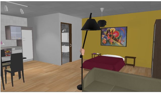
Figure 1: A view of the virtual scenario