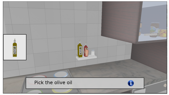
Figure 3: A view of task 1