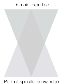
Figure 1. Team members were distributed along a spectrum of knowledge, creating reciprocal interdependence.

Some team members, such as therapists, fell somewhere in the center of the spectrum. For example, speech therapists had expertise in speech-language pathology and applied it to their work with the same child once or twice a week. Although they had some regular contact with the child, outside of these one-on-one therapy sessions, speech therapists depended on other staff members for information about the child's regular progress.