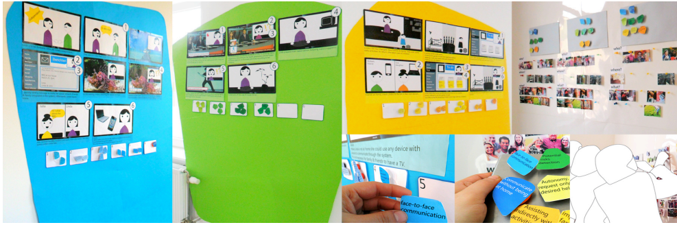
Figure 2: Realization Pathway prototype

and take in the process, they increase their knowledge while at the same time their need of taking part in reciprocal activities is fulfilled [5]. Defining the group size is a matter of finding a good balance between having enough people providing technical knowledge as well as varying perspectives and experiences to trigger insightful discussions and giving everyone the chance to experience the mediator directly. Anything between two (co-discovery) and six (e.g. as in focus groups) is suggested.