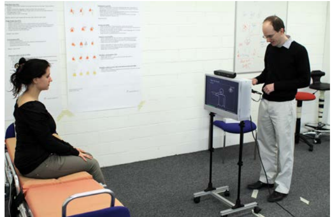
Figure 1: Assess MS system in use

Copyright 2014 ACM 1-58113-000-0/00/0010 ...$15.00.