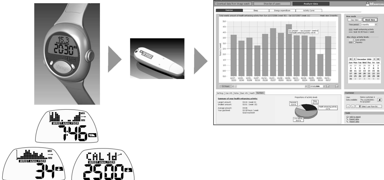
Figure 1. Vivago Personal Wellness Manager concept including the PWM device, USB radio frequency interface, and analysis software.

Twenty volunteer subjects (10/10 men/women) participated in laboratory measurements at KIHU Research Institute for Olympic Sports, Jyväskylä, Finland. The inclusion criteria were: age between 18 to 40 years at the time of measurement and body mass index (BMI) between 18.5 and 30.0 kg/m 2 (normal weight or overweight, no obesity). Exclusion criteria were pregnancy and any disease or injury preventing physical activity. The background information of the subjects is presented in Table I. The study was approved by the ethical committee of the University of Jyväskylä.