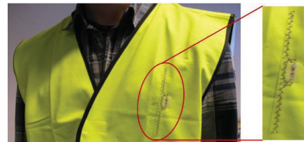
Figure 1. Wearable tag based on an embroidered antenna.

since patch antennas benefit from built-in antenna-body separation provided by the ground plane and thus achieve potentially higher read range compared with dipole-type tags. In the future, we will apply the discussed techniques for wearable antennas in wireless BMI systems, which are discussed below.