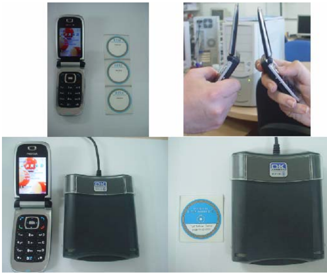
Figure 1. NFC devices and operation modes.

in the patient tag. Control of drugs, by matching the patient and drug tags, for instance, is thereby possible at the patient's bedside by means of simple touch.